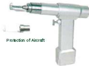
Cat No. 616-21