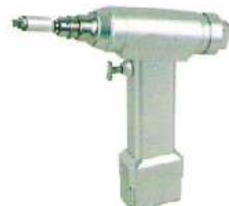
Cat No. 616-18