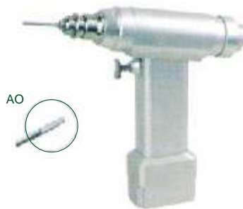
Cat No. 616-14