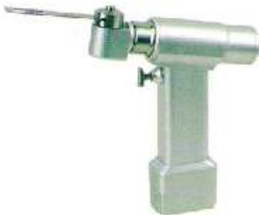
Cat No. 616-13