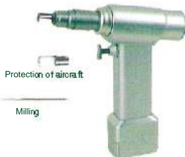
Cat No. 616-16