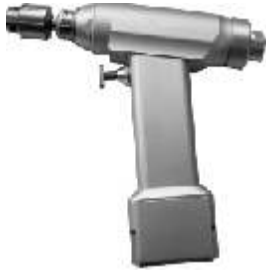
Cat No. 616-10