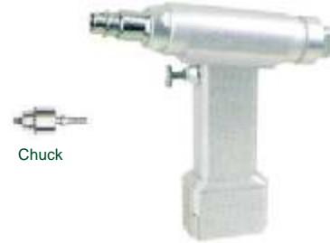
Cat No. 616-12