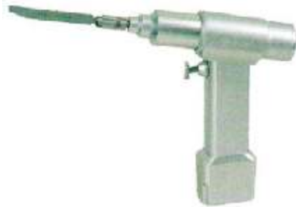
Cat No. 616-19