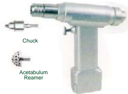
Cat No. 616-20