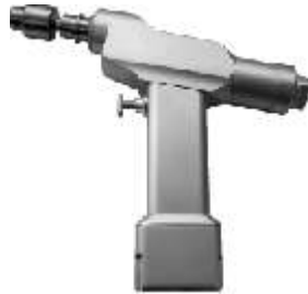
Cat No. 616-11