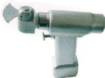
Cat No. 616-23