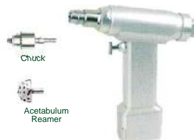
Cat No. 616-24