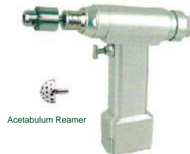
Cat No. 616-22