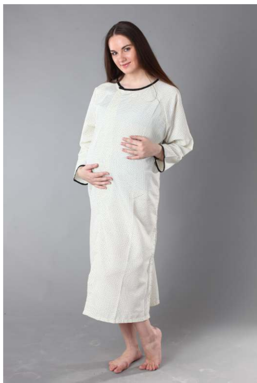
Code No 836-10