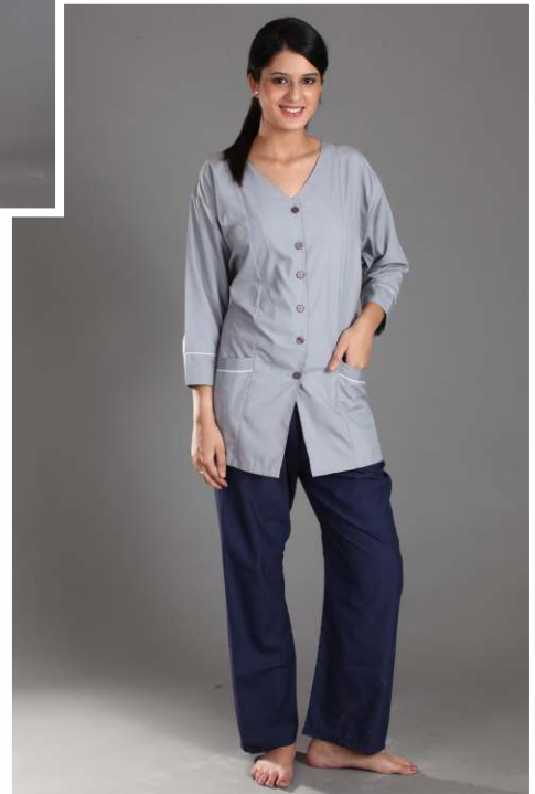
Code No 837-50