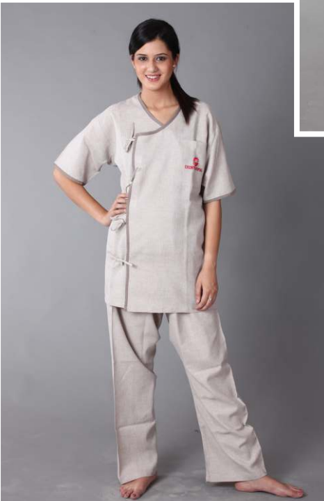
Code No 836-40