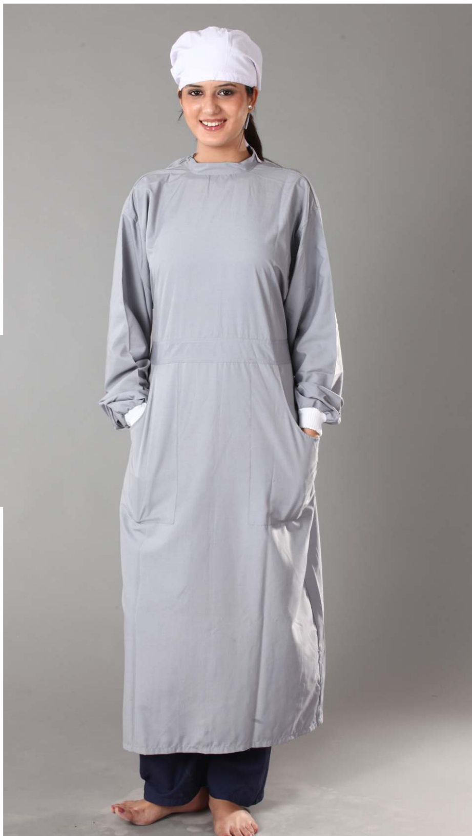
Code No 838-20