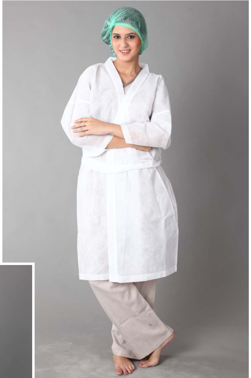
Code No 838-10