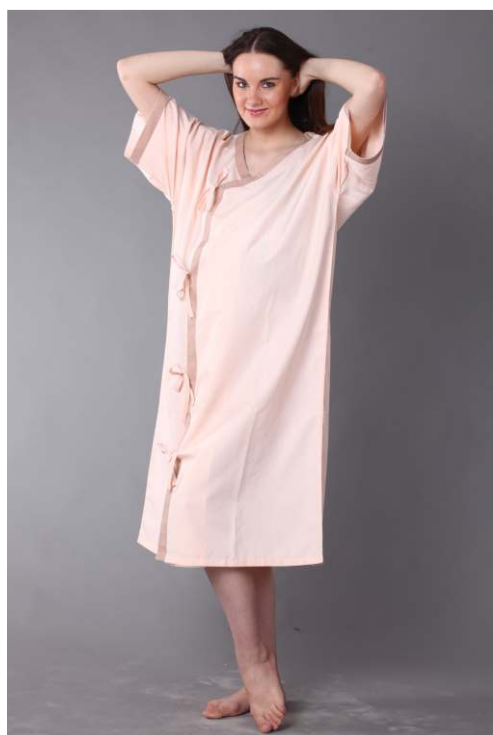
Code No 836-30