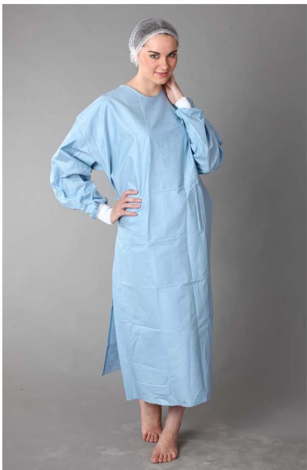
Code No 838-20