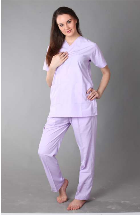
Code No: 835-10