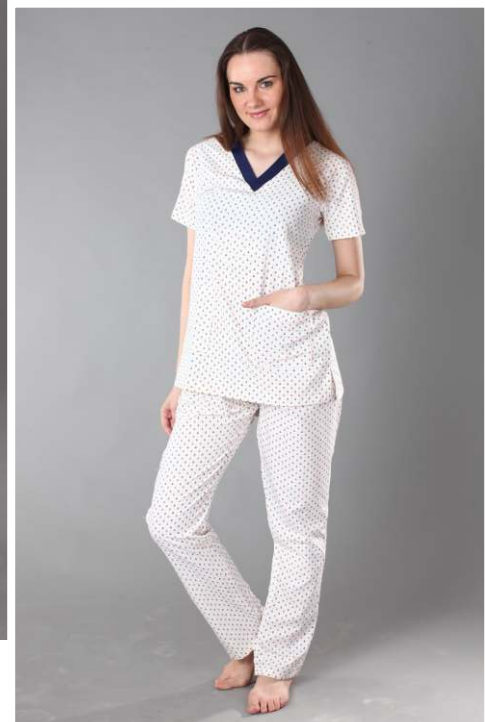
Code No 835-60