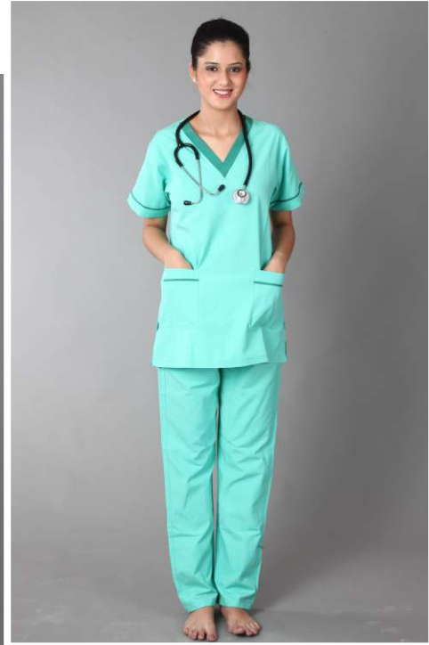
Code No 835-50