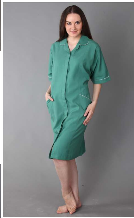
Code No 837-10