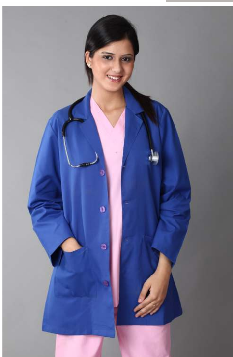
Code No 839-10