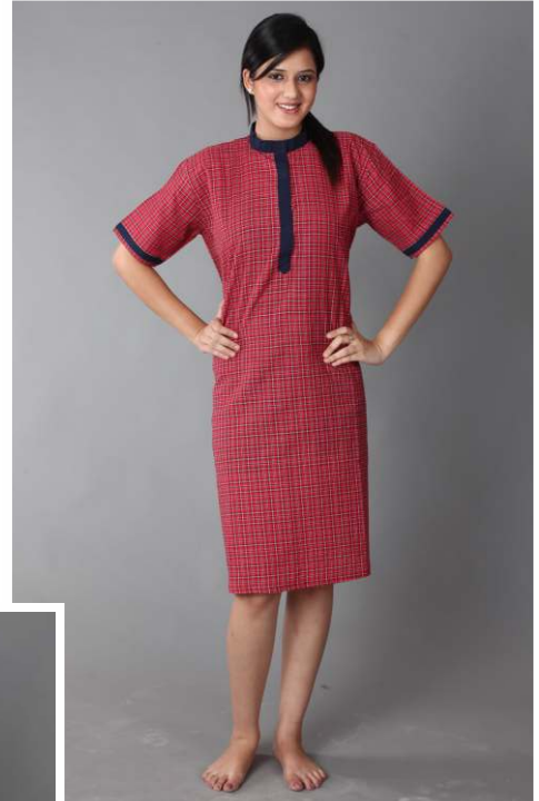
Code No 837-30