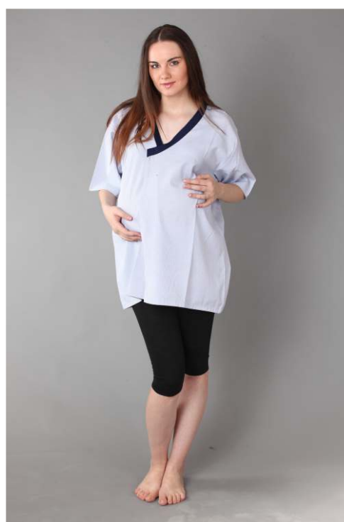
Code No 836-50