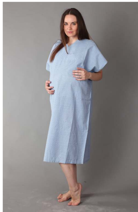
Code No 836-20