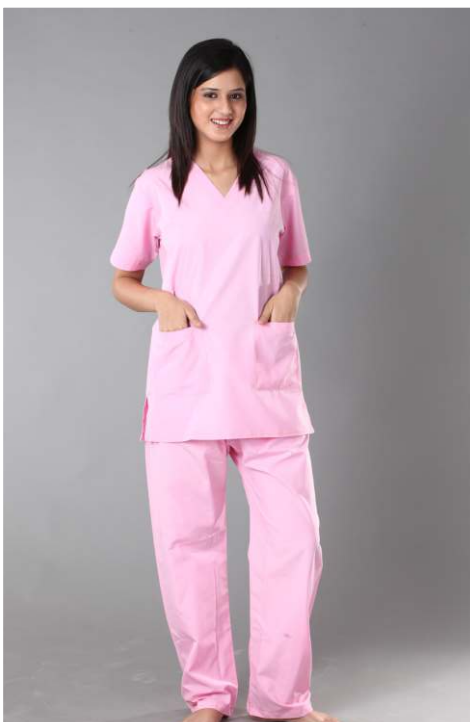
Code No 835-20