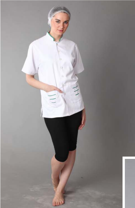
Code No 837-20