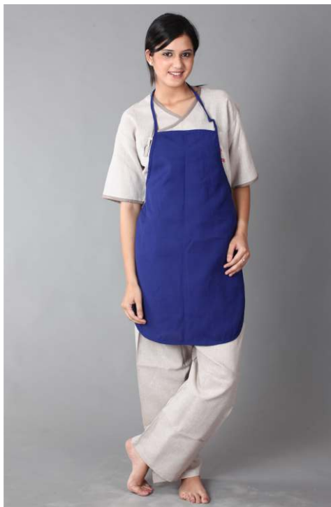
Code No 839-50