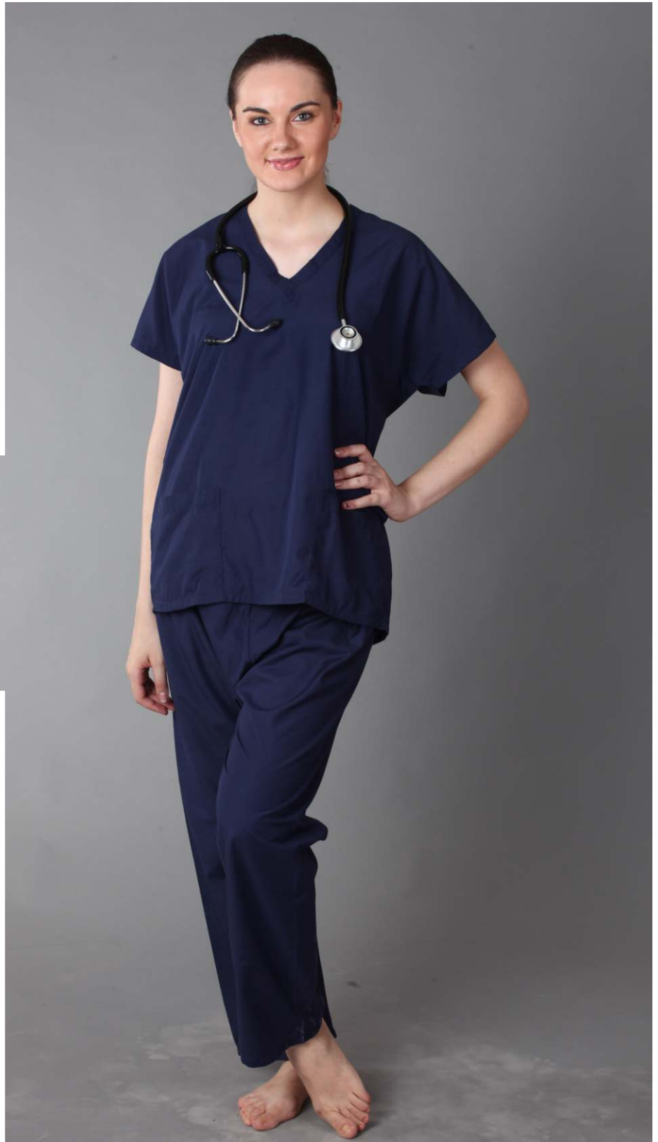
Code No 835-30