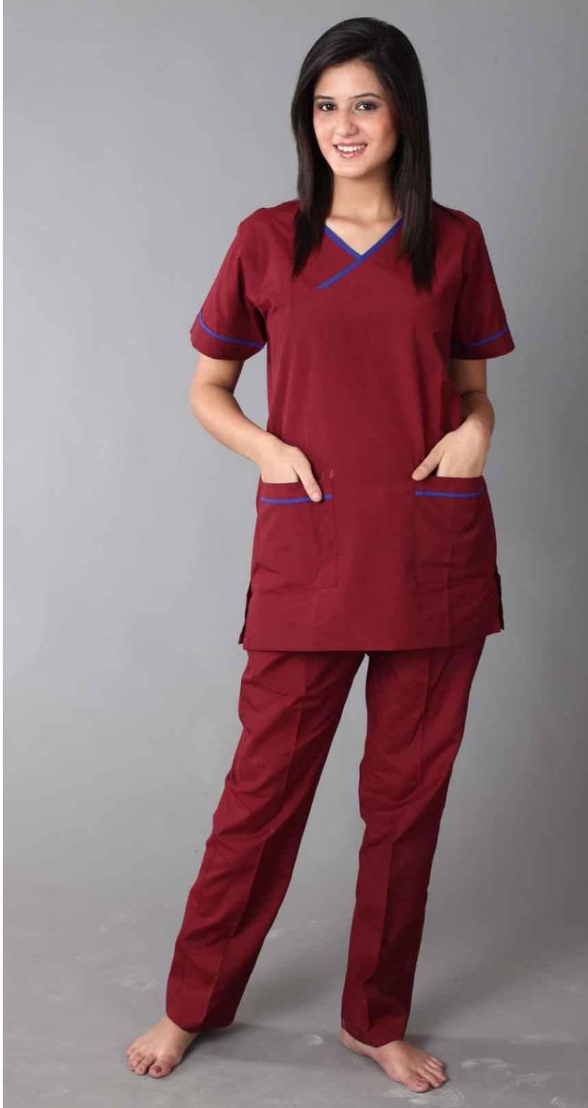
Code No 835-40